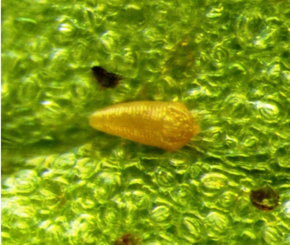
Figure 1. Adult of Tegolophus ipomoeifoliae (Eriophyidae) on leaf of sweet potato.